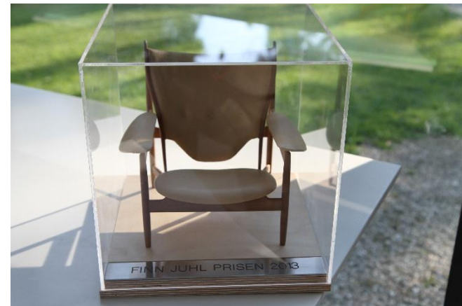
And a price