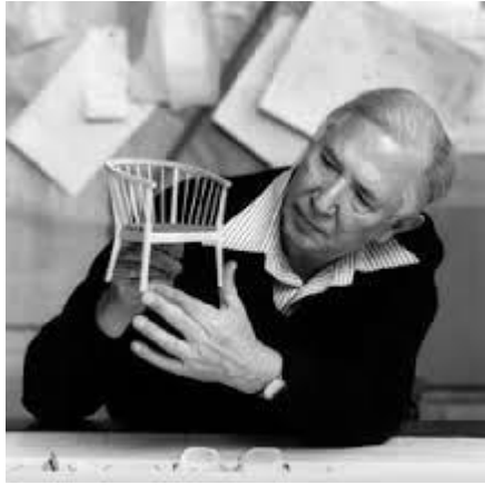
Hans J. Wegner